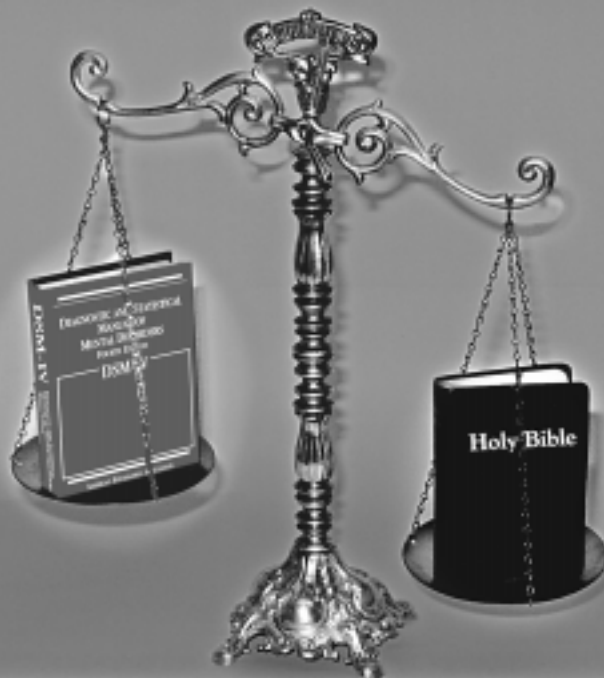
The American Psychiatric Association’s removal of homosexuality from its list of disorders has arguably done more than any other single event to change society’s attitudes about homosexuality.

During the coming year AFA Journal plans to offer in depth features dealing with the implications of the gay agenda in education, government, media and entertainment, the institution of marriage and family, and business. Taken together with this special supplement, we hope these articles will sum up the current state of the issue from a Christian perspective. All the articles will be available at www.afa.net as they are published in the AFA Journal .